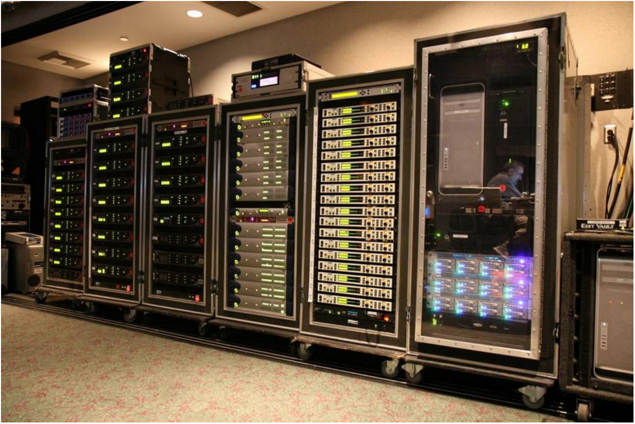
A rack with professional A/D converter in Abbey Road Studio—they were used for the orchestral tracks in Star Wars movies.

DW Files for music distribution is a good concept, basically. Be it downloads or streaming. The problem is that musicians are not paid enough by the companies offering the streams. MQA may seem like a good approach to get a higher audio quality through a smaller internet bandwidth. But that could be done in a less complicated way and at lower cost for all involved.