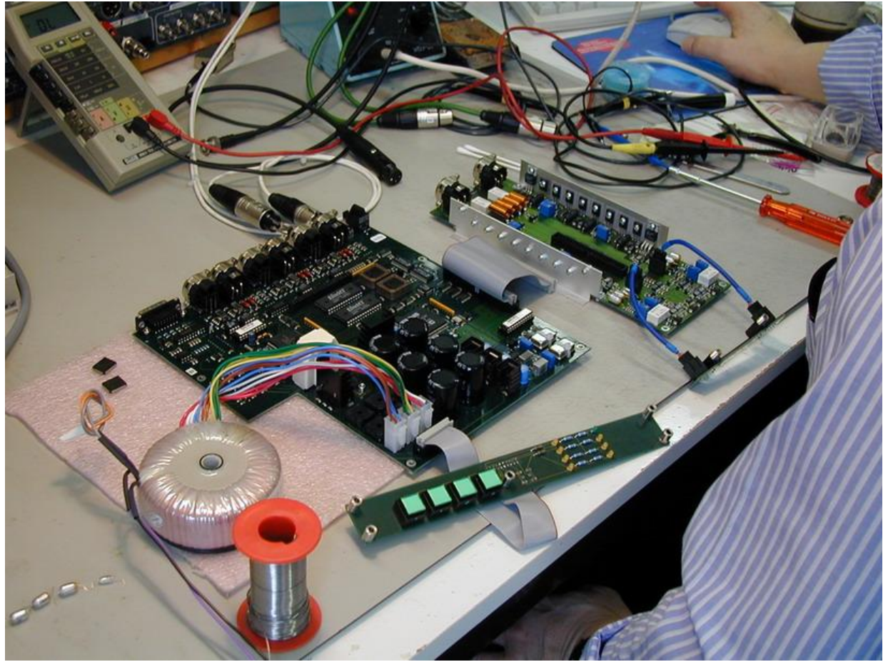
D/A Converter's assembly for the "Pro" line

WP Is there an upsampler, sampling frequency converter, or some other DD converter in the DAC502?